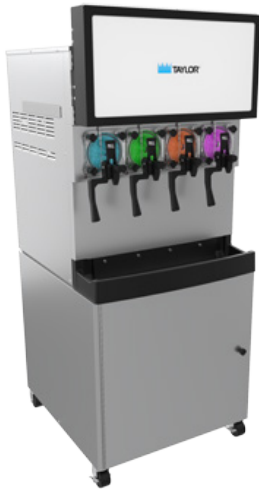
Shown with Optional Syrup Storage Cart

Consult Taylor distributor for merchandising options.