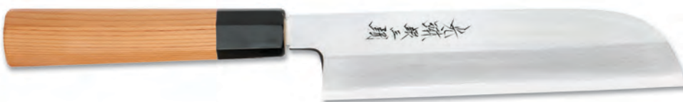
Kamagata Usuba HKR-G3KU-180 Kamagata Usuba 7.0" (18cm) HKR-G3KU-195 Kamagata Usuba 7.6" (19.5cm) HKR-G3KU-210 Kamagata Usuba 8.2" (21cm)