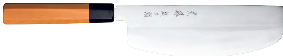
Sushikiri HKR-G3SK-225 Sushikiri 8.8" (22.5cm)