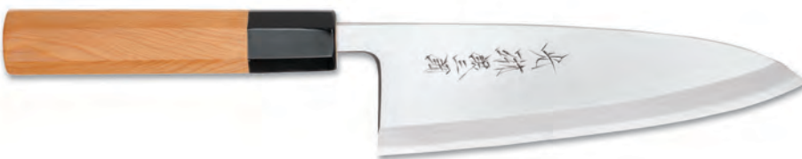
Deba HKR-G3DE-165 Deba 6.4" (16.5cm) HKR-G3DE-180 Deba 7.0" (18cm)