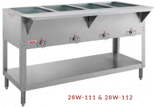
28W-111 & 28W-112