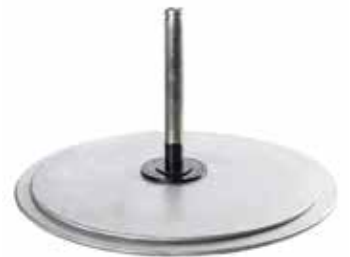
Avalon Cantilever Double Galvanized Steel Plate Base 40" x 1", 335 lbs. (two bases stacked) 2233350-0170