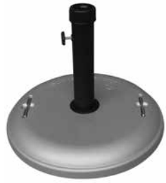
48 lb. Poly-crete Umbrella Base 2239848-0170 • Platinum 2239848-0150 • Black