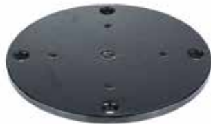
Direct Surface Mount for Cantilever Umbrellas 2239812-0150 • Gloss Black