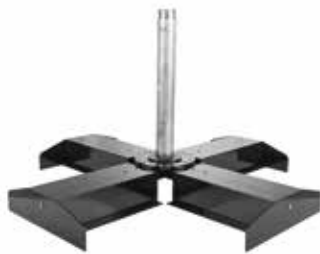
Modular Cross Base for Cantilever Umbrellas Holds 2-3 16" pavers per quadrant Pavers not included 2239816-0150