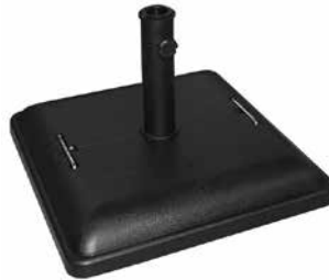
81 lb. Freestanding Poly-crete Umbrella Base 2239881-0150 • Black 2239881-0170 • Platinum