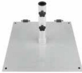
75 lb. Freestanding Umbrella Base Steel plate base with wheels 2239875-0150 • Black 2239875-0174 • Silver Mist 2239875-0121 • Bronze