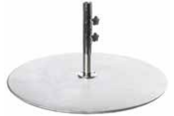
150 lb. Freestanding Umbrella Base Galvanized Steel Plate 2230150-0170