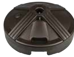
50 lb. Resin Coated Concrete Base 2239850-0170 • Matte Silver 2239850-0150 • Black 2239850-0121 • Bronze