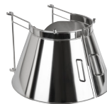
VFSL-100-ERGO VFSR-100-ERGO 100 qt. SST fully shielded left and right bowl guard