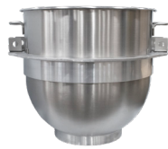
VBOWL-100BRKT 100 qt. SST bracketed bowl compatible with MaxiLift