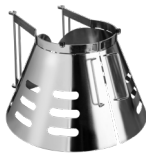
VPSL-100-ERGO VPSR-100-ERGO 100 qt. SST partially shielded left and right bowl guard