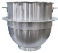
VBOWL-100 100 qt. SST bowl