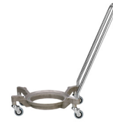
VBTRUCK-100-ERGO 100 qt. bowl truck