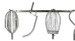
VTOOLRACK60-150 60-150 qt. tool rack