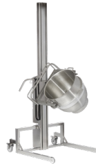
VLIFT-M100H 100 qt. bowl lift