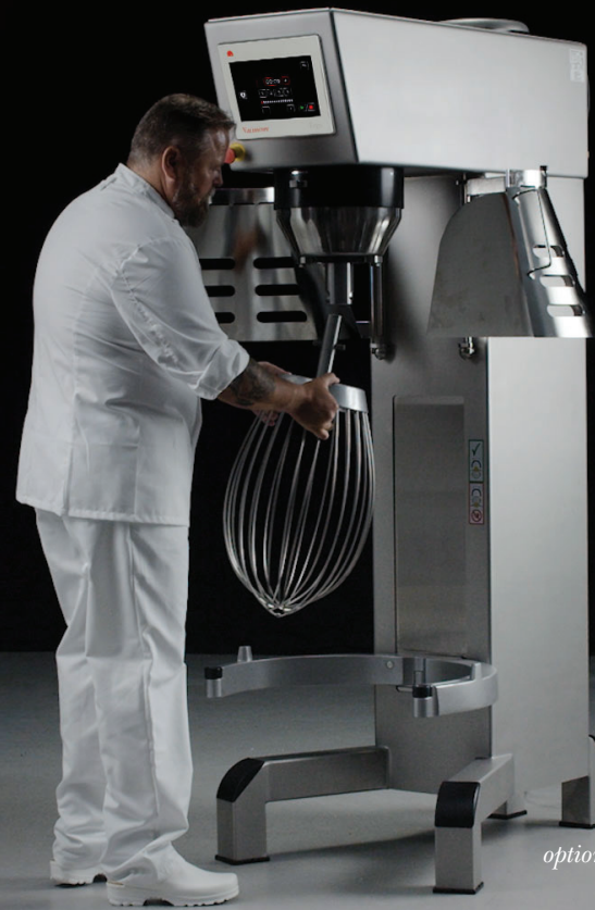
Shown with optional solid bowl guard design

The self-aligning bowl further reduces the need for heavy lifting, automatically adjusting the bowl into position when raising, and releasing when lowering. No need to lift the bowl onto the bowl arms or the bowl trolley.