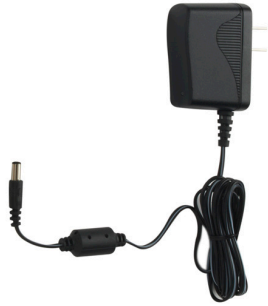
16-199 AC Adapter