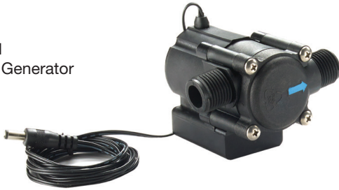
16-501 Hydro Generator