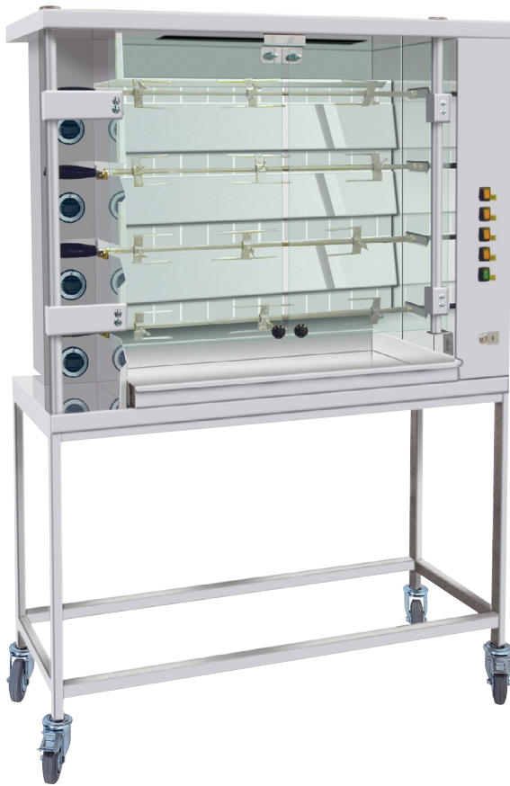
FF1175-4G-SS on 1175 PR4 Stand

The FauxFlame is Rotisol's response to commercial needs for performance accompanied by light weight, minimal size, and mobility. FauxFlame rotisserie ovens offer rapid cooking and quality results with the attractive display and mouth-watering aromas that customers love to find in the marketplace.