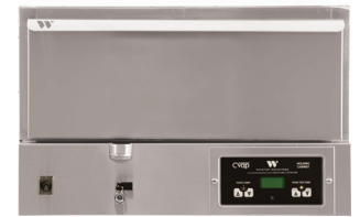
HBB5D1 CVAP HOLD/SERVE DRAWER Electronic Differential Controls