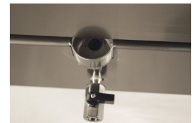
Easy Fill Spout Makes filling and draining the unit a snap!