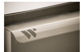
New Handle Design Comfortable grip with a sleek modern look.