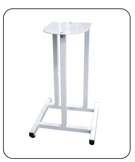
CCD Complete Stand For DMS-30