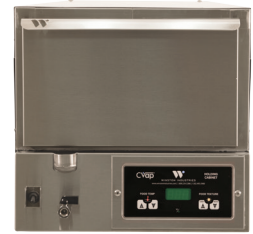
HBB5N1 CVAP HOLD/SERVE DRAWER Electronic Differential Controls