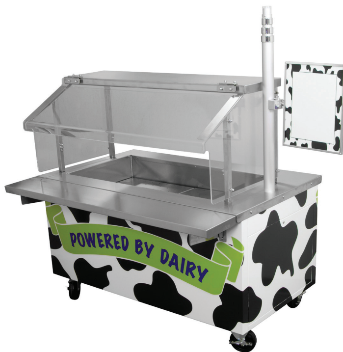
CTI46 shown with optional custom exterior design package, breath guard, and tray slide.