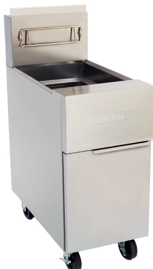
GF40 Shown with casters