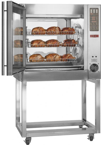
LCR-7W-2B with LRS7 Stand Shown