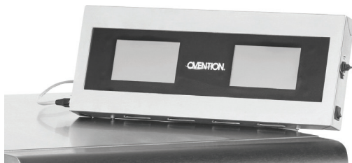
Optional remote mountable control module with 10ft cord

MORE AIR= BETTER QUALITY, FASTER Patented air flow technology means 3x more air than traditional impingement.