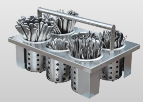
E1-BS60E-SS Drop-In Silverware Basket