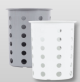
N-200 / G-300 Nylon High-Temp Cylinders