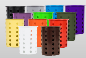
RP-25 Color Series Colored Silverware Cylinders