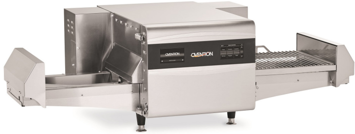
THE MATCHBOX® M1718

† Ventless certification is for all food items except for foods classified as "fatty raw proteins". Such foods include bone-in, skin-on chicken, raw hamburger meat, raw bacon, raw sausage, steaks, etc. If cooking these types of foods, consult local HVAC codes and authorities to ensure compliance with ventilation requirements. Ultimate ventless allowance is dependent upon AHJ approval, as some jurisdictions may not recognize the UL certification or application. If you have questions regarding ventless certifications or local codes, please email connect@ventionovens.com .