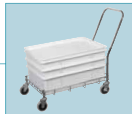
Transport dough boxes