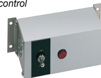
RMB-3F with toggle switch and indicator light

The infrared heating element shall be tubular metal sheathed. The foodwarmer shall be ready for electrical installation. Options and accessories shall include adjustable or non-adjustable tubular stand, angle brackets, suspension chain and fittings, sneeze guard, indicator light, and Chef LED Bulb. All Designer Color and Gloss Finishes are anti-microbial paint.