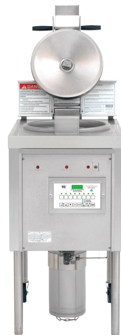
LP46 & LP56 COLLECTRAMATIC® HIGH EFFICIENCY FRYER 8-Channel Programmable Controls