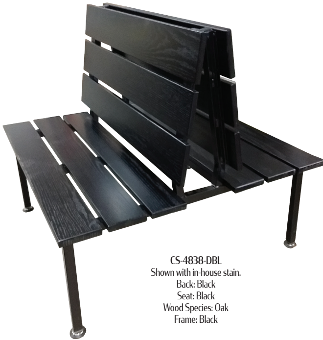
CS-4838-DBL Shown with in-house stain. Back: Black Seat: Black Wood Species: Oak Frame: Black