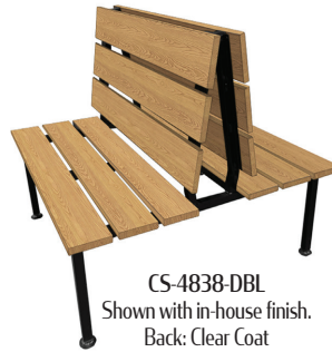
CS-4838-DBL Shown with in-house finish. Back: Clear Coat Seat: Clear Coat Wood Species: Oak Frame: Black