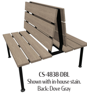
CS-4838-DBL Shown with in-house stain. Back: Dove Gray Seat: Dove Gray Wood Species: Oak Frame: Black