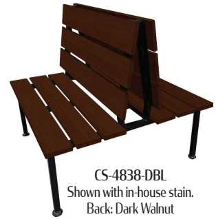
CS-4838-DBL Shown with in-house stain. Back: Dark Walnut Seat: Dark Walnut Wood Species: Oak Frame: Black