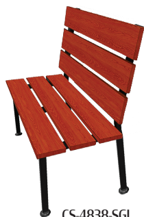
CS-4838-SGL Shown with in-house stain. Back: Cherry Seat: Cherry Wood Species: Oak Frame: Black