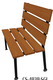
CS-4838-SGL Shown with in-house stain. Back: Autumn Haze Seat: Autumn Haze Wood Species: Oak Frame: Black