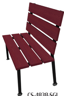
CS-4838-SGL Shown with in-house stain. Back: Mahogany Seat: Mahogany Wood Species: Oak Frame: Black