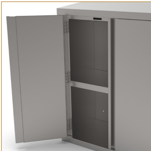
SWINGING DOORS WITH INTEGRAL HANDLES