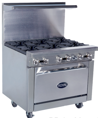
RR-6 with optional casters