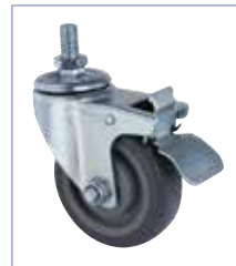
SRK-CTB 4" caster with brake