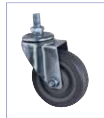
SRK-CT 4" caster