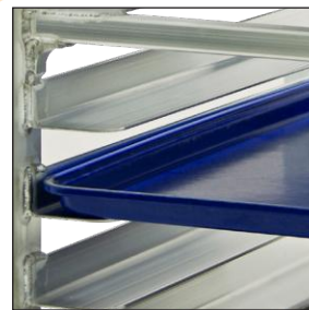
Wide-Angle Pan Racks

#4339 - 20 sets of angle runners #4340 - 12 sets of angle runners