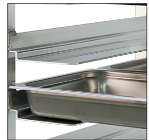
Stepped-Angle Pan Racks

#4339 - 20 sets of angle runners #4340 - 12 sets of angle runners