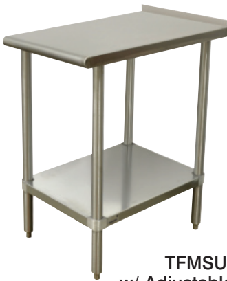
TFMSU Series w/ Adjustable Undershelf