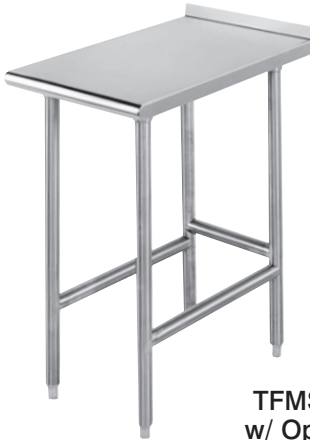
TFMS Series w/ Open Base