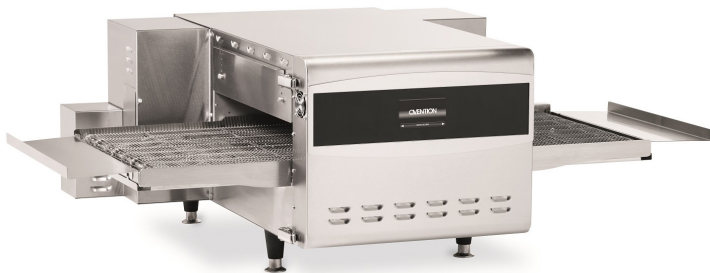
THE CONVEYOR C2000

† Ventless certification is for all food items except for foods classified as "fatty raw proteins". Such foods include bone-in, skin-on chicken, raw hamburger meat, raw bacon, raw sausage, steaks, etc. If cooking these types of foods, consult local HVAC codes and authorities to ensure compliance with ventilation requirements. Ultimate ventless allowance is dependent upon AHJ approval, as some jurisdictions may not recognize the UL certification or application. If you have questions regarding ventless certifications or local codes, please email connect@ventionovens.com .