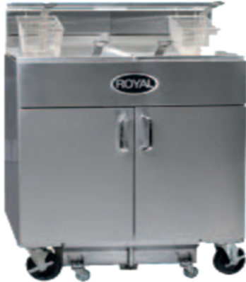
RFT-60-2-EM with optional casters

Models: RFT-60-2-XX RFT-60-3-XX RFT-60-4-XX RFT-60-5-XX