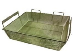
One Full Size Basket