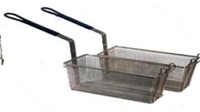
Two Half Baskets