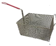
One Full Size Basket with one handle (ATV Only)