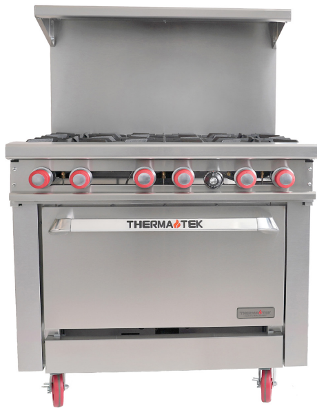
TMD36-6-1 (Optional casters shown)

Therma-Tek 115 Rotary Drive, Valmont Industrial Park West Hazleton, PA 18202