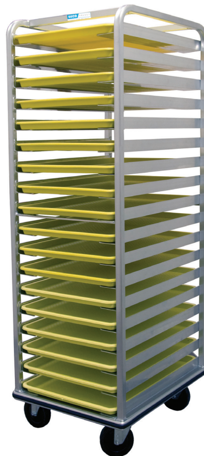
ORV-3-1818-X shown with optional perimeter bumper