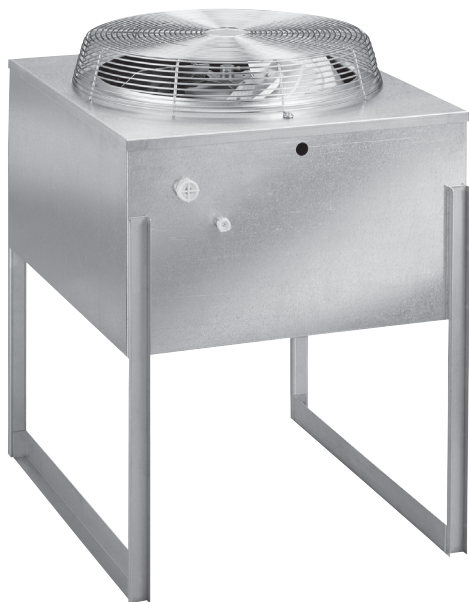
JCF900 Remote Condenser

JCF0500 JCF0500Q(Coated Coil) JCF0900 JCF0900Q(Coated Coil)