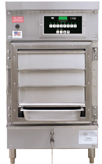
HA8503-04 CVAP UNIVERSAL HOLDING BIN CABINET

Allow at least 2" (51 mm) clearance on sides, particularly around ventilation holes. Allow at least 18" (457 mm) clearance from heat producing equipment, such as ovens or fryers. Generally this equipment does not need to be installed under a mechanical ventilation system (vent hood). Check local health and fire codes for requirements specific to your location. Unit must be installed at level.