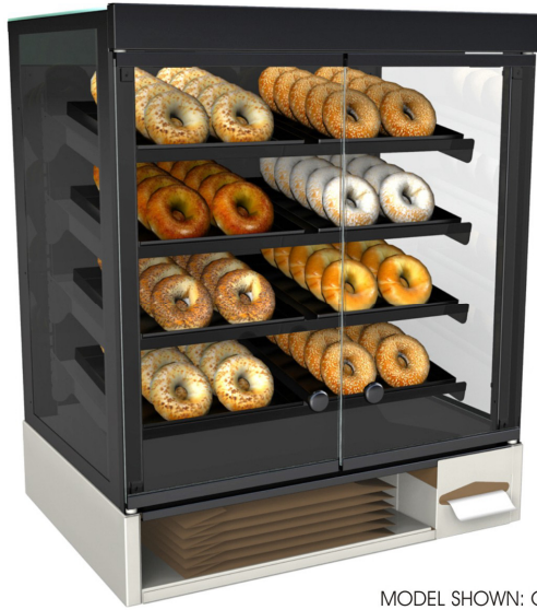
MODEL SHOWN: CSC3223

Lengths include end panels 30-7/8"L x 22-5/8"D x 36-3/8"H