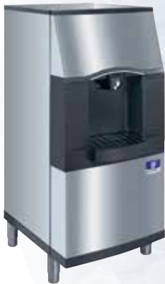
SPA and SFA Series Ice Dispensers

Available in 22" (55.9 cm), 30" (76.2 cm) and 48" (121.9cm) widths. Featuring one-piece corrosion-free composite-resin base, impact-resistant polyethylene bin liner, soft durameter trim that helps silence bin closing, internal scoop holder and protectant bumper guards. Optional Multi-mount external scoop holder also available.