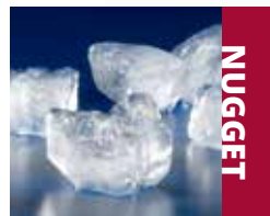
RNF0320 nugget ice machine on Multiplex® SV-250 beverage dispenser