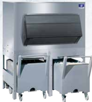
Ice Storage Bin and Cart System

Equipped with ice gate for increased employee safety, easier ice removal, and reduced spillage. The 30" (76.2 cm) model is one of the smallest footprint large capacity storage bins available.