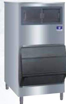
F-Style Large Capacity Ice Storage Bins

Available in 22" (55.9 cm), 30" (76.2 cm) and 48" (121.9 cm) widths.