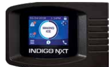
easyTouch ® Display