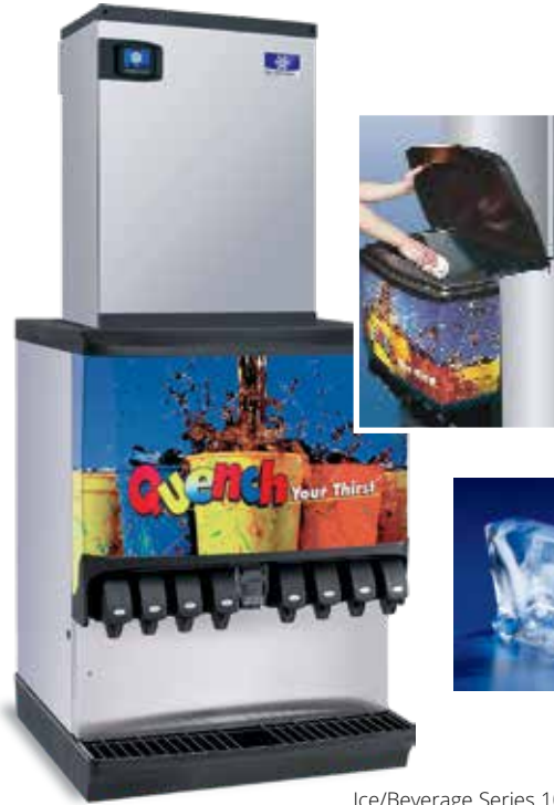
Ice/Beverage Series 1020C ice machine on Multiplex SV-250 beverage dispenser

This compact Ice/Beverage Series ice machine is available in high volume ice production capacities to satisfy nearly every beverage dispenser application at quick service restaurants, convenience stores, recreational or educational foodservice operations.