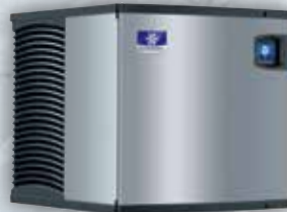
Modular Ice Machines

Featuring high-volume dispensing with patented "push-for-ice" rocking chute dispense mechanism and paddle wheel technology. Also available in an ice and water dispensing.