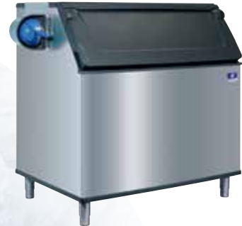
D-Style Ice Storage Bins

Available in 22" (55.9 cm), 30" (76.2 cm) and 48" (121.9cm) widths. Featuring one-piece corrosion-free composite-resin base, impact-resistant polyethylene bin liner, soft durameter trim that helps silence bin closing, internal scoop holder and protectant bumper guards. Optional Multi-mount external scoop holder also available.