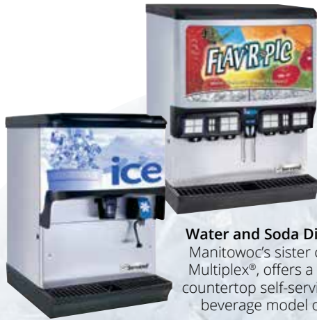
Water and Soda Dispensers Manitowoc's sister company, Multiplex®, offers a complete countertop self-service ice and beverage model offering.

Find the perfect ice machine pairing with Manitowoc's wide variety of ice storage bins and dispensers.