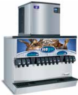
iT420 ice machine on Multiplex® MDH-302 beverage dispenser

Manitowoc dice or half dice cubes crushed into small pieces using a Manitowoc machine and a Multiplex® beverage dispenser equipped with icepic® ice crusher. Provides a selection