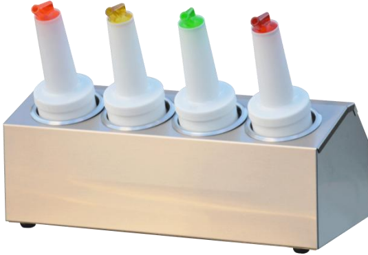
Model #: CC-LTC-4BR (Bottles not included)

See next page for a complete list of available models.