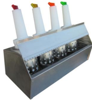
Model #: CC-LTC-4BR (Rear view, bottles not included)