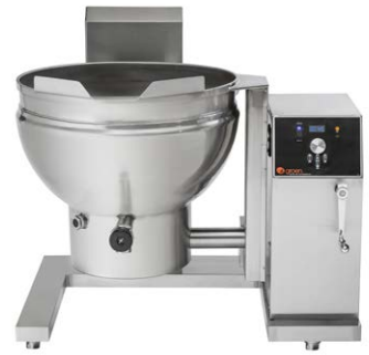
DHS-40A Model shown