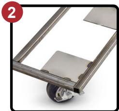
Built for Transport