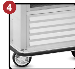
Bottom Mounted Compressor