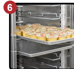
No Tilt Tray & Shelf Slides