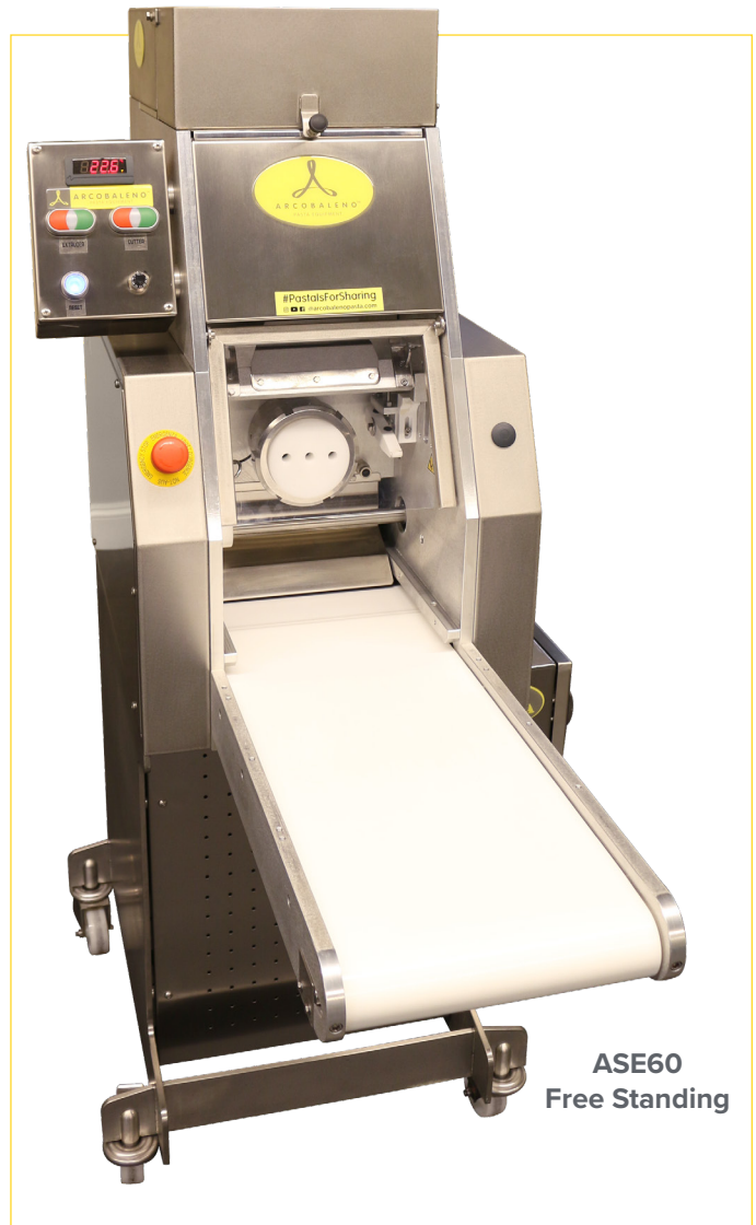
ASE60 Free Standing