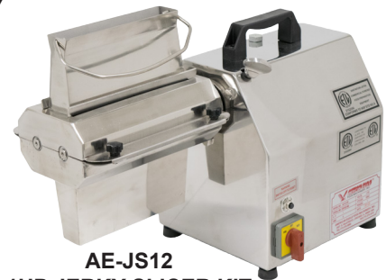
AE-JS12 1HP JERKY SLICER KIT