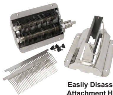
Easily Disassembled Attachment Head For Cleaning***