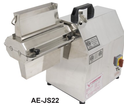
AE-JS22 1.5HP JERKY SLICER KIT