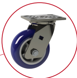
HD Casters High Quality 5" x 2" Polyurethane swivel casters