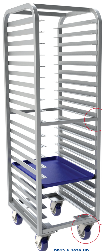
PR12-A-1820-HD Front Load