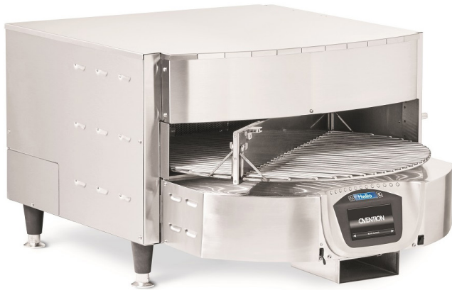
THE MATCHBOX® M360-12

MORE AIR= BETTER QUALITY, FASTER Patented air flow technology means 3x more air than traditional impingement.