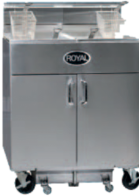
RFT-50-2-EM with optional caster

Models: RFT-50-2-XX RFT-50-3-XX RFT-50-4-XX RFT-50-5-XX