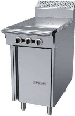
Model C18-10S 18" Add-A-Units, Front Fired Hot Top