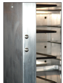
Field Reversible Door Mount