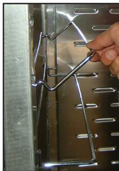
Adjustable Universal Runners