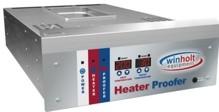
NHP-PD-DGT Removable Drawer Digital shown also available with Analog Drawer Makes Cleaning Quick & Easy