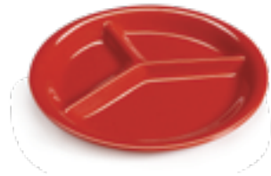
Melamine 3-Compartment Plate CP-10-RSP 10.25" 26 cm