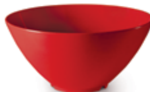
SN-108-RSP 10 oz. (11 oz. rim-full) 2 dz. 296 ml (325 ml)