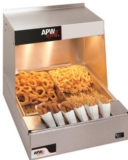
Model: Countertop Fry Holding Station CFHS-21