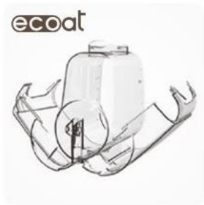
Energy Saving Less condensation system