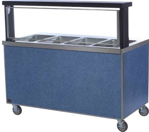
TWHF-46PG (shown with optional foodshield)