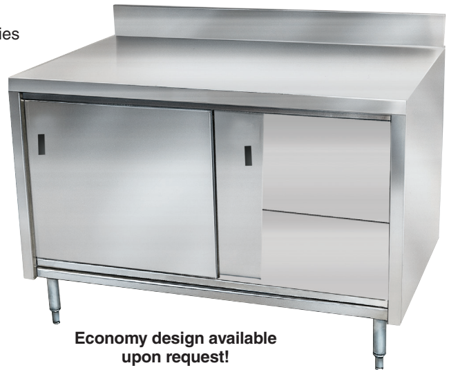
Economy design available upon request!