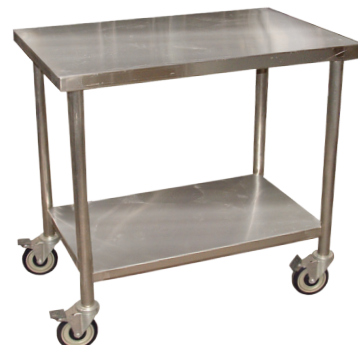
Caster Option for all work tables